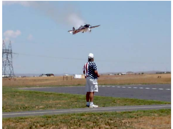
Our guest pilot Bert Sutton flying his 40% Cap 232

The Fourth of July Independence Day R/C Airshow drew in a profit of over $200, and boasted over 200 guests from 11 A.M. - 1 P.M., with 20 pilots demonstrating their flying skills by entertaining the guests. Over 70 airplanes were present on display, and 21 specators tried their hand at flying a trainer on the buddy-box! There were 31 kids present at the candy drop, showered by Fred Damm's monster bomb-bay door equipped plane. At the beginning of the day, the same aircraft was used for a patriotic fly-by, with flags on each wing.