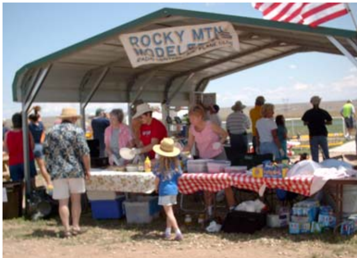
Thanks to our chowline volunteers!