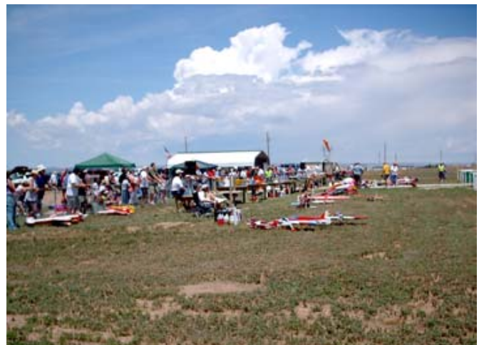
The crowd turn-out at the Independence Day R/C Airshow on July 4th.