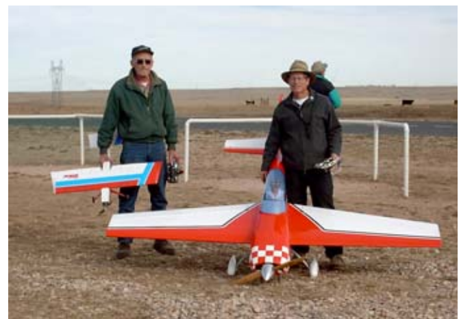
What's wrong with this picture?

Next Meeting - Monday, February 6th, 7:00 P.M. at Home State Bank, 303 E. Mountain Ave