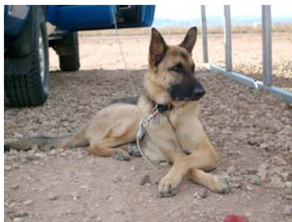
"Jake" at Modeleers Field enjoying watching his dad fly!

Something you may not know about me: I really enjoy being at the flying field with all of you. A little pat on the head and a toss of my ball makes my day.