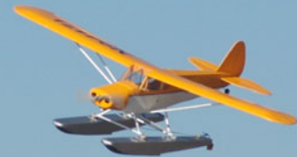
Jerry Craig's fine model flying over Warren Lake last summer

Featured: F6F-3 with Royal Netherlands Navy markings