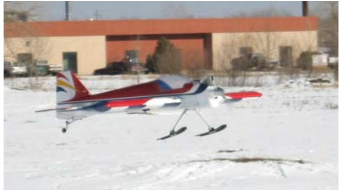
Clint Hultgren's U-Can-Do ski-flying at Clifton (12-7-06)