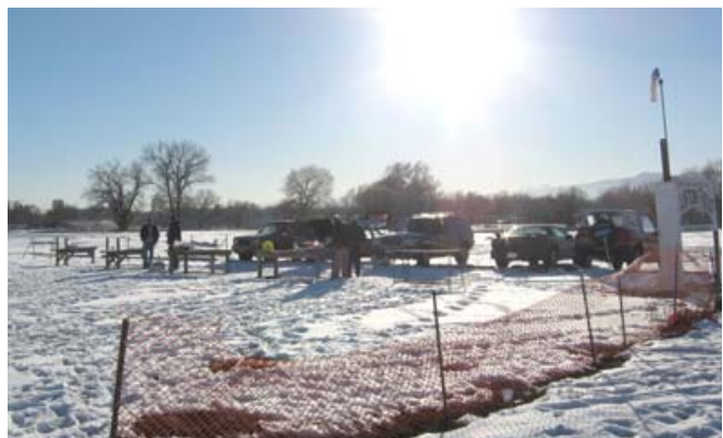
The "ski flyers" at Clifton on 12-8-06!