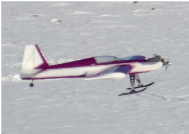
Garret Hultgren (flying Clint Hultgren's) Somethin' Extra on skis also at Clifton (12-16-07).