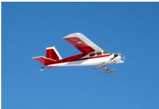
Fred Damm's big Kadet on skis at Clifton Field on a very nice ski-flying day! (12-16-07).