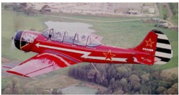
Above is a picture of a Yak 52