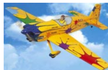
Great Planes Matt Chapman Cap 580

Answer to last month's "Scrambled Plane Game":