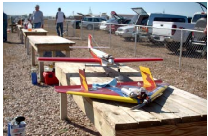
Two planes belonging to guests from the Valley View Flyers in Greeley.