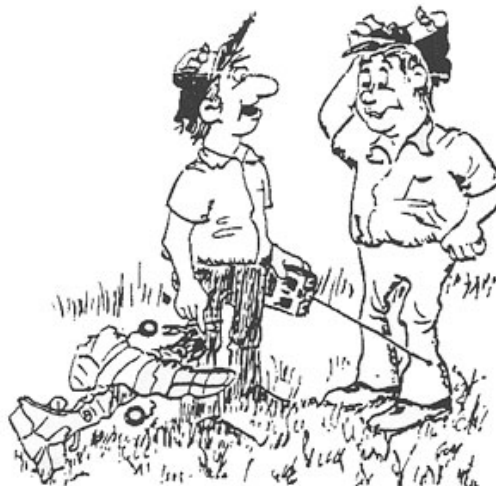
Thirty-five seconds ago, I valued your advice.

JAX Outdoor Gear 1200 N College Ave. Fort Collins, CO 80524 Phone: (970) 221-0544