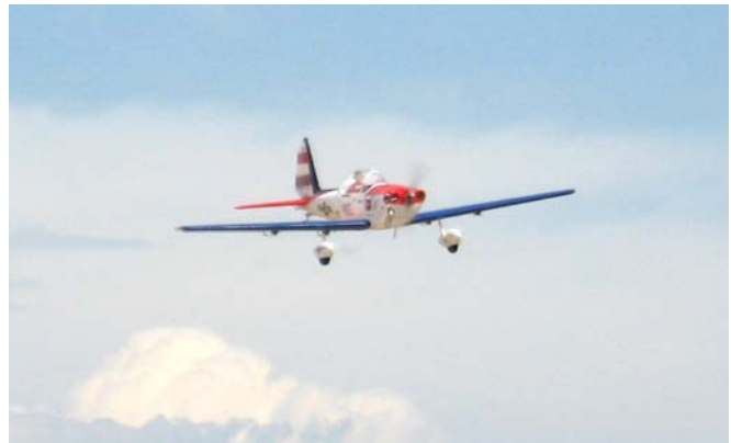
Sam's Super Chipmunk on its maiden flight. (Horton Field, 9-16-07)