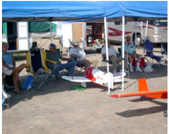
The Modeleers' tent at the 13th annual Big Bird Festival at Drake Field