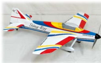
Last Month's "Scrambled Plane" Aeroworks Stingray

Congratulations to last month's winner of the "Scrambled Plane Game"