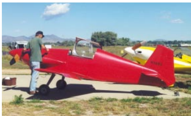
Above is a picture of Fred's red Midget Mustang built in 1971. The yellow and white plane on the right is Fred's RV-3, which he constructed in 1981.