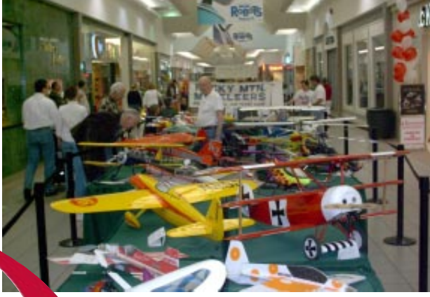
The 2005 mall show at Foothills Mall. The planes were plentiful as were the shoppers! (2-12-05)

Next Meeting -- March 1st, 7:00 P.M. at First National Bank -- 1600 N. College