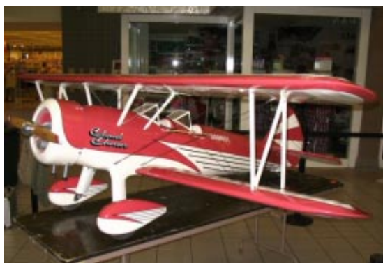
You can tell by the eight-foot table this plane is sitting on, it's a big bird!